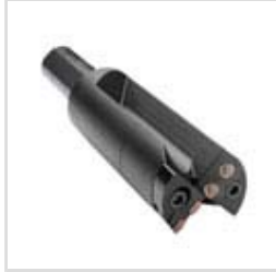
Revolution Drill Requires no Pilot Hole Allied Machine & Engineering Corp.

Home Current Issue News New Products Round Table Newsletter Editor's Corner Helpful Links Previous Issues Buyer's Guide Advertise Subscribe Contact Us