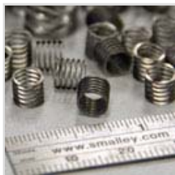
Metric Crest-to-Crest Wave Springs Smalley Steel Ring Co.

Carr Lane has introduced a variety of new toggle clamps with safety locks.