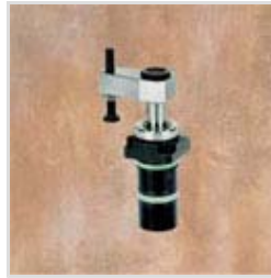
Specially Priced Swing Clamps Carr Lane Roemheld

The patent pending 7792VX family of milling cutters from ATI Stellram reduces part costs by improving metal removal rates as much as 90% when compared to conventional cutters, according to the company.