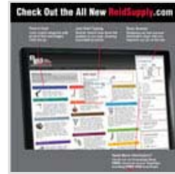
Reid Supply's New Website Reid Supply Co.

Carr Lane Roemheld's newest heavy-duty swing clamps are of high quality, but are specially designed to be more affordable than previous models.