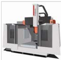
Handtmann Backlash-Free Gantry RS Handtmann CNC Technologies Inc

FeatureCAM's new version includes enhancements across the full range of functionality.