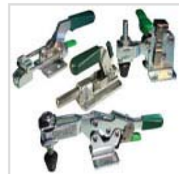
Toggle Clamps with Safety Locks Carr Lane

Adding a 4th-axis rotary table or indexer to a machining center is a sure way to boost productivity, reduce setups and increase accuracy on multi-op parts.