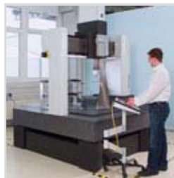
ACCURA 3D Coordinate Measuring Machine Carl Zeiss

Smalley Steel Ring Co. has introduced a series of small, standard-sized Crest-to-Crest wave springs.