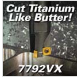
7792VX High Feed Milling Cutters ATI Stellram

The patent pending 7792VX family of milling cutters from ATI Stellram reduces part costs by improving metal removal rates as much as 90% when compared to conventional cutters, according to the company.