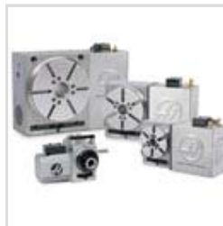
Haas Increases Performance of Core Rotary Products Haas Automation Inc.

The GANTRY RS from Handtmann uses rack and pinion drives, to achieve highest dynamics for the linear axis.