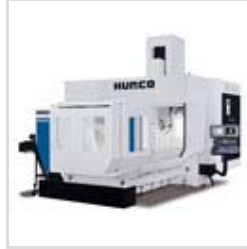
DCX22 Dual Column 2 Meter Machine Hurco USA

Allied Machine & Engineering Corp. provides hole-making solutions for the metal cutting industry worldwide.