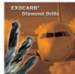
EXOCARB Diamond Drills OSG

Systematically implementing customer requests was the main challenge in the development of the new Accura coordinate measuring machine.