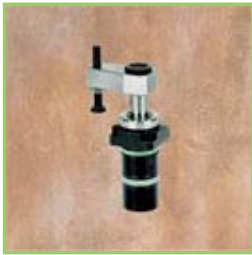
Specially Priced Swing Clamps Carr Lane Roemheld

Carr Lane Roemheld's newest heavy-duty swing clamps are of high quality, but are specially designed to be more affordable than previous models.