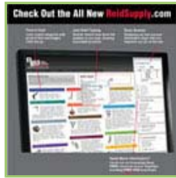
Reid Supply's New Website Reid Supply Co.

Carr Lane Roemheld's newest heavy-duty swing clamps are of high quality, but are specially designed to be more affordable than previous models.