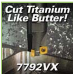
7792VX High Feed Milling Cutters ATI Stellram

Systematically implementing customer requests was the main challenge in the development of the new Accura coordinate measuring machine.