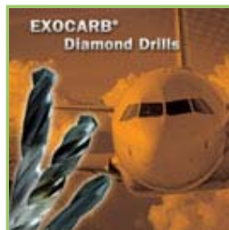
EXOCARB Diamond Drills OSG

The patent pending 7792VX family of milling cutters from ATI