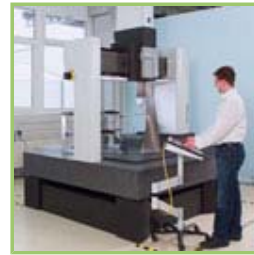
ACCURA 3D Coordinate Measuring Machine Carl Zeiss

What Does It Take to Build a World-Class e-Commerce Website?