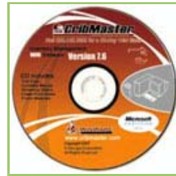
CribMaster Software Solution CribMaster

The MILLAC-VH Series 5-axis machining centers allow the production of complex, multi-face parts in one set up.