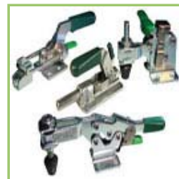
Toggle Clamps with Safety Locks Carr Lane

OSG has developed several new carbide drills for carbon fiber reinforced plastic (CFRP).