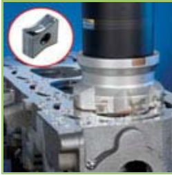
TANGMILL ID5 PCD Wiper Insert, 2 HELIMILL Inserts Tipped With IB85 PCBN Iscar

The new LNAR 1106PN-R-S-W ID5 PCD tipped wiper insert has a very large frontal radius and sharp cutting edge.