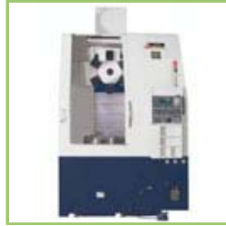
Hi-Net DMC-900HN Double Column Machining Center Absolute Machine Tools

The new LNAR 1106PN-R-S-W ID5 PCD tipped wiper insert has a very large frontal radius and sharp cutting edge.