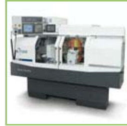
Studer S33-Silverbird Plus United Grinding

The DMC tackles a variety of materials at high feedrates and with a high degree of accuracy.